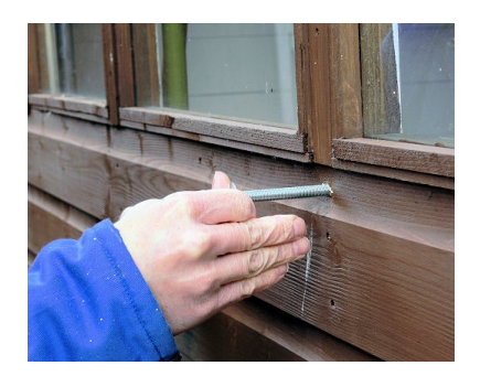
Push a coach bolt through from outside the shed (Note that your bolts may have a coloured coating pre-applied)

What if the bolt is too short? If your timbers are unusually thick, you may find that you need to counterbore the hole from the outside of the shed, or to use longer bolts than are supplied in the kit. We can supply longer M8 coach bolts (as can most DIY stores) and you can use these instead, if required.