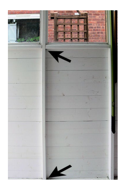
A good location will allow you to place the side brace close to a window or above the floor. The arrows indicate alternative positions for the side brace. We will use the top option in this shed. The Shackle itself will be between the arrows (see next photo)

The Shed Shackle is easy to fit but you should think it through in advance to be sure that you get the best position and therefore the best combination of fixings.