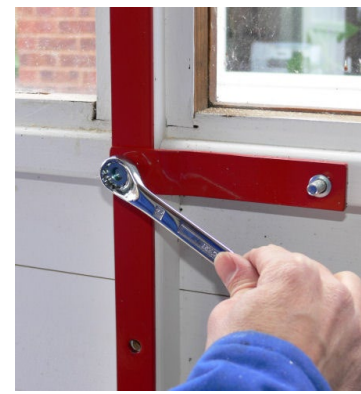
Tightening shear nuts with a ring spanner...

You may find that the wood is somewhat crushed under the head of each bolt. Do not be too concerned by this as it is all becoming steel-reinforced. You should continue to tighten each nut until the head shears off. However, be wary if the bolt is near a window as you don't want to break the glass! If you find the wood is really too weak and just continues to crush, you can weaken the shear nut by tapping the side of its hexagonal head with a hammer (or nicking under the head with a hacksaw) and then trying again with the spanner. This will usually allow the nut to shear, but if it continues to crush the wood, simply weaken it further with a hacksaw until it can be sheared satisfactorily.