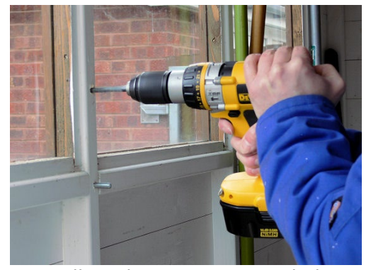
Drilling the top extension hole

8. Push the second bolt through the wall of the shed and re-fit the extension bar. Alignment errors can be corrected by using the drill to draw the hole a little. This is done by putting sideways pressure on the drill when it is spinning in the hole already drilled. Be careful not to put a lot of pressure on the drill – moving it in and out and taking your time should allow you to elongate the hole in the desired direction without too much difficulty and without risk of breaking the drill bit.