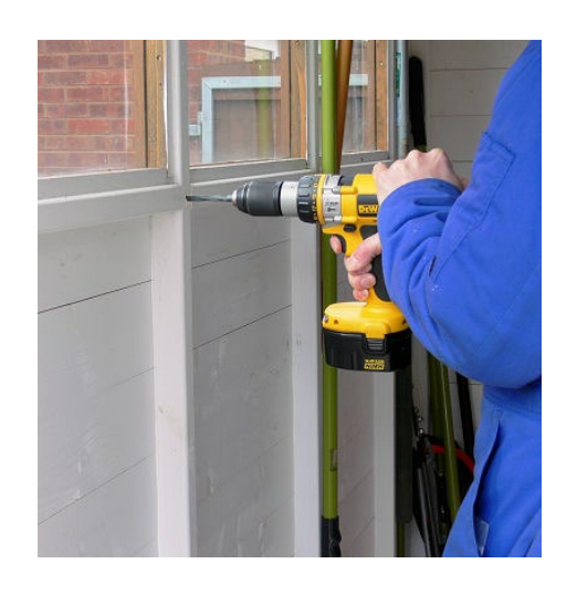
Drilling the first hole

Do not be surprised if the drill encounters a nail: The drill bit supplied is suitable for drilling through nails that might be encountered. This is quite likely at the intersection between framing members of the shed.