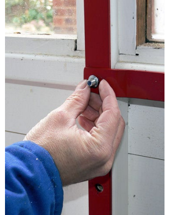
Fit a washer to each bolt

Fit a washer and then add a shear nut, loosely, on each bolt. The shear nut is fitted with the hexagonal head pointing outwards. Spin the nut onto the bolt thread in each case.