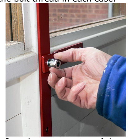
Then fit a shear nut on top of the washer